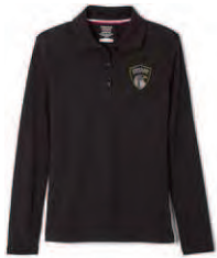
Long Sleeve Interlock Knit Polo with Picot Collar (Feminine Fit)