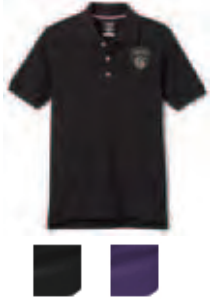
Short Sleeve Pique Polo

Sales prices as of June 2021. ALL PRICES SUBJECT TO CHANGE AT THE VENDORS DISCRETION AT ANYTIME!