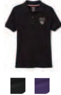
Short Sleeve Interlock Polo with Picot Collar (Feminine Fit)