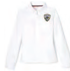
Long Sleeve Oxford Blouse with Princess Seams