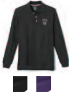
Long Sleeve Pique Polo